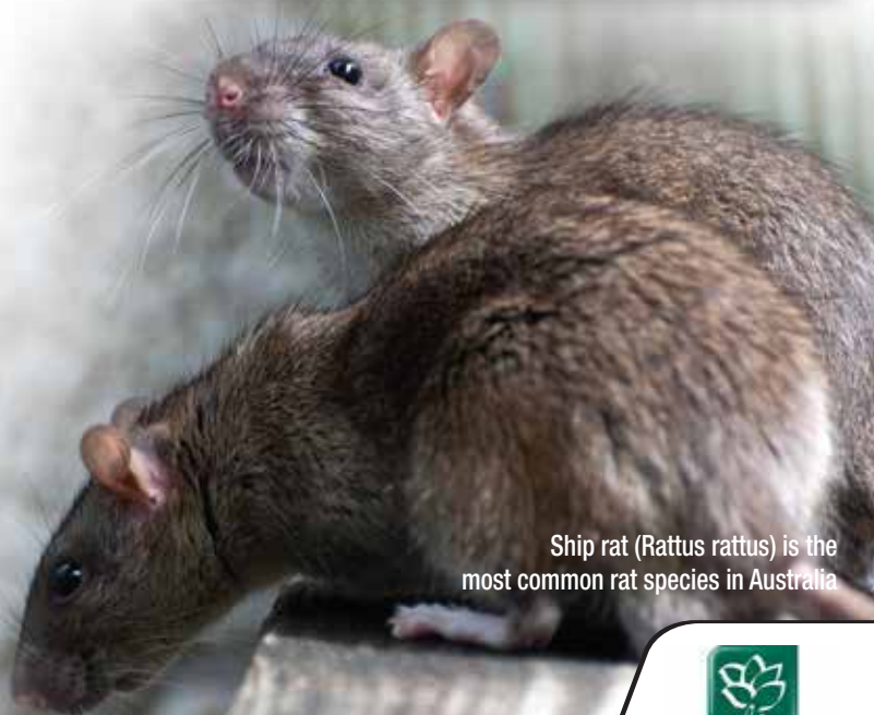
Ship rat ( Rattus rattus ) is the most common rat species in Australia