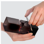
ARM the trap