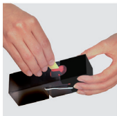
POSITION bait or lure before arming