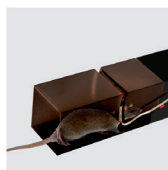
CATCH: Metal bar triggered by mouse