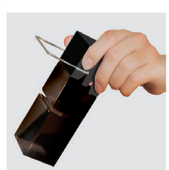
RELEASE bar and shake to dispose of mouse