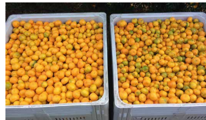
Imperial Mandarins Treated

Application: Foliar Spray 40%-50% fruit colour