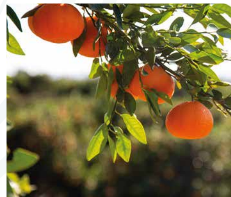
Results from an independent trial conducted in 2020 by Staphyt AUSTRALIA Ltd

Leading to reduced need for gassing of fruit, less picks, and lower labour requirements.