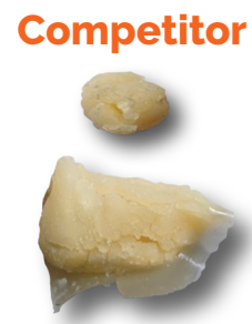
Clear evidence of poor integrity/cracking