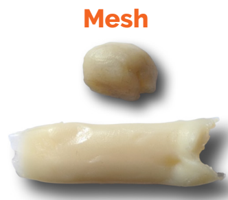
Much greater volume/ no cracking

The results clearly show the quantitative differences in dry weight as well as the integrity of the polymer.