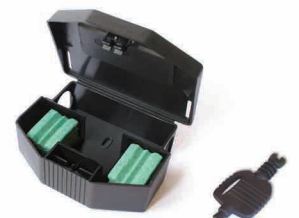
Pack Size GENERATION MOUSE STATION - Carton of 20