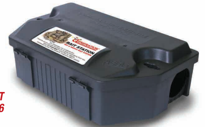
Pack Sizes GENERATION RAT Carton of 6